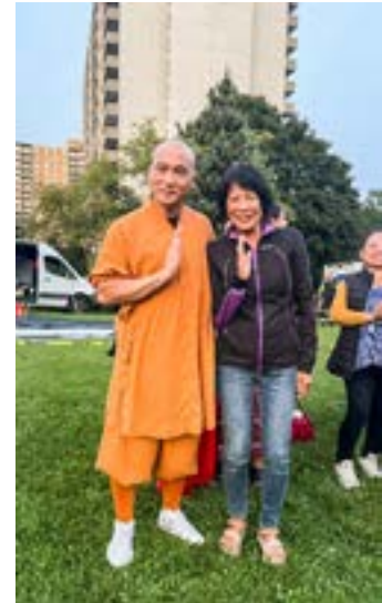
Kung Fu Movie Nights