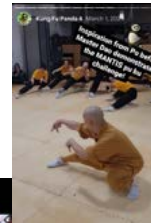
Paramount Pictures Collaboration