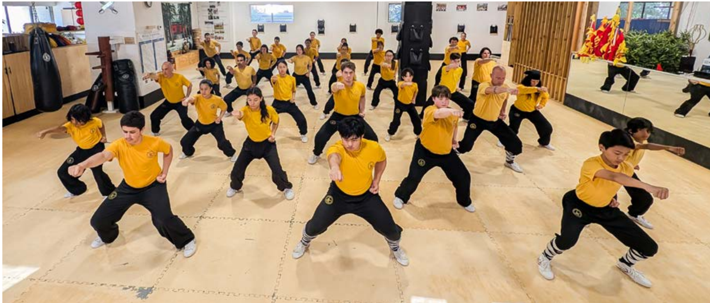
Shaolin Team Canada 2026 members