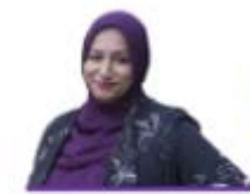
Ausma Malik Deputy Mayor & City Councillor for Ward 10, Spadina-Fort York