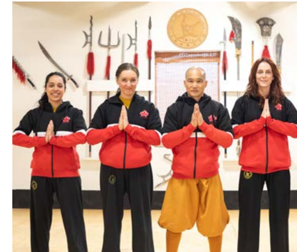
Shaolin Team Canada 2026 Committee

All members are proudly Canadian and come from a variety of multicultural backgrounds including Chinese, Croatian, Brazilian, Scottish, British, Taiwanese, Iranian, French, Filipino, Scottish-Mohawk, Dutch, Serbian, Hungarian, Portuguese, and Irish.